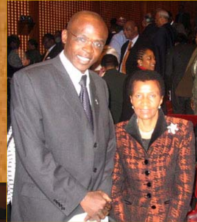
SA First lady