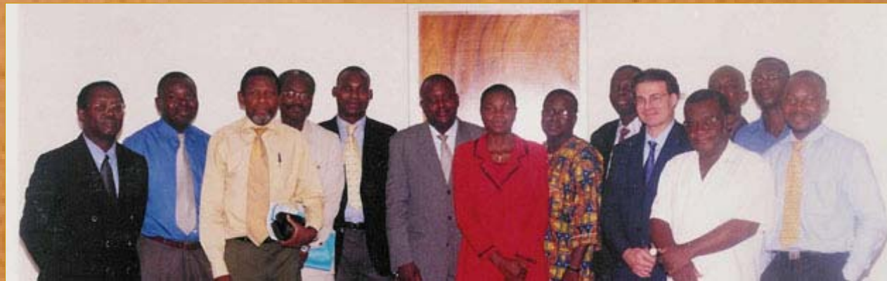
Benin and Togo team members at a meeting in Lome