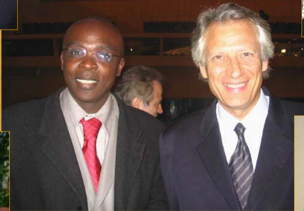
Dominique de Villepin, French Interior Minister