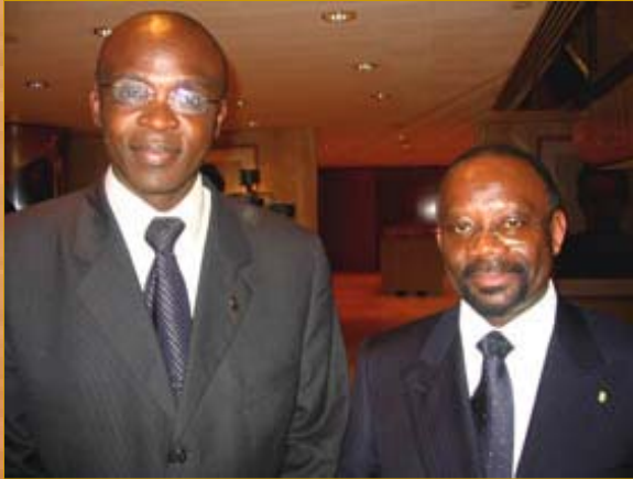
ACP secretary general