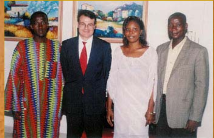
Guinea: team members