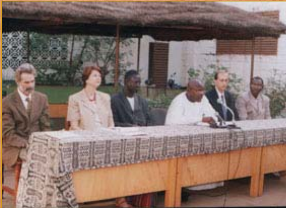
Mali: launch in the presence of the Canadian Ambassador