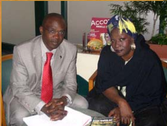
Aminata Traoré, ex minister of Culture, Mali