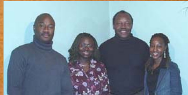
Canada: team members