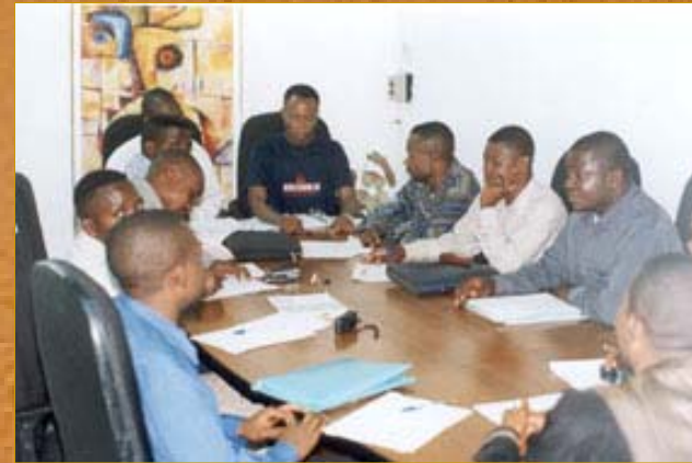
DRC: board meeting