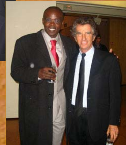
Jack Lang, speaker of Commission of Africa, France